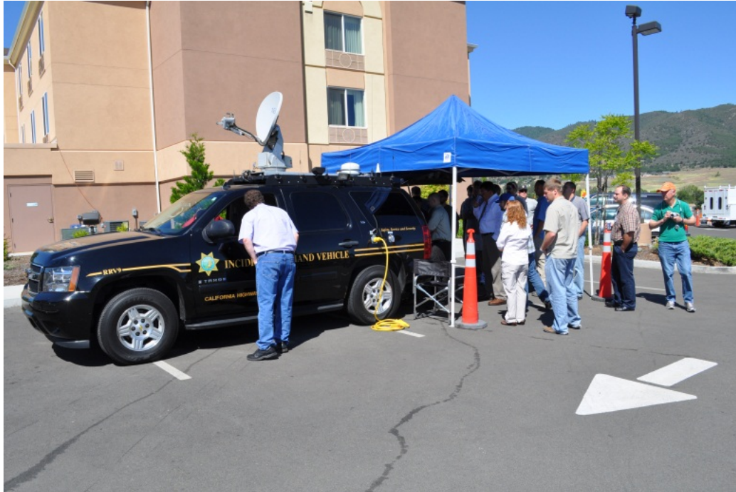
California Highway Patrol Rapid Response Vehicle (RRV)