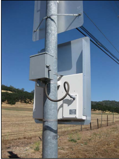
Figure 3: Example of Grid Charged Sign Installation