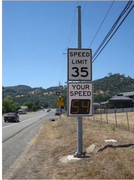
Figure 2: Permanent Speed Sign Example